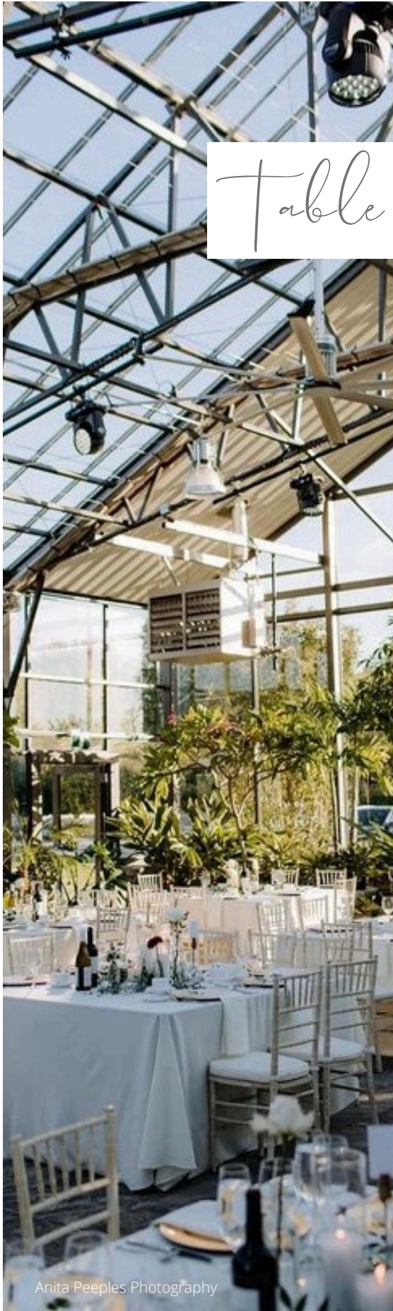
Table of Content Cont.